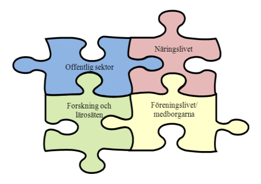
Figure 1. The city of Västerås creates added value for the public sector, industry, research and academia, as well as NGO:s, citizens and residents.

International work contributes to the internationalization of Västerås and our businesses as well as our ability to live with and appreciate the values in cultural diversity.